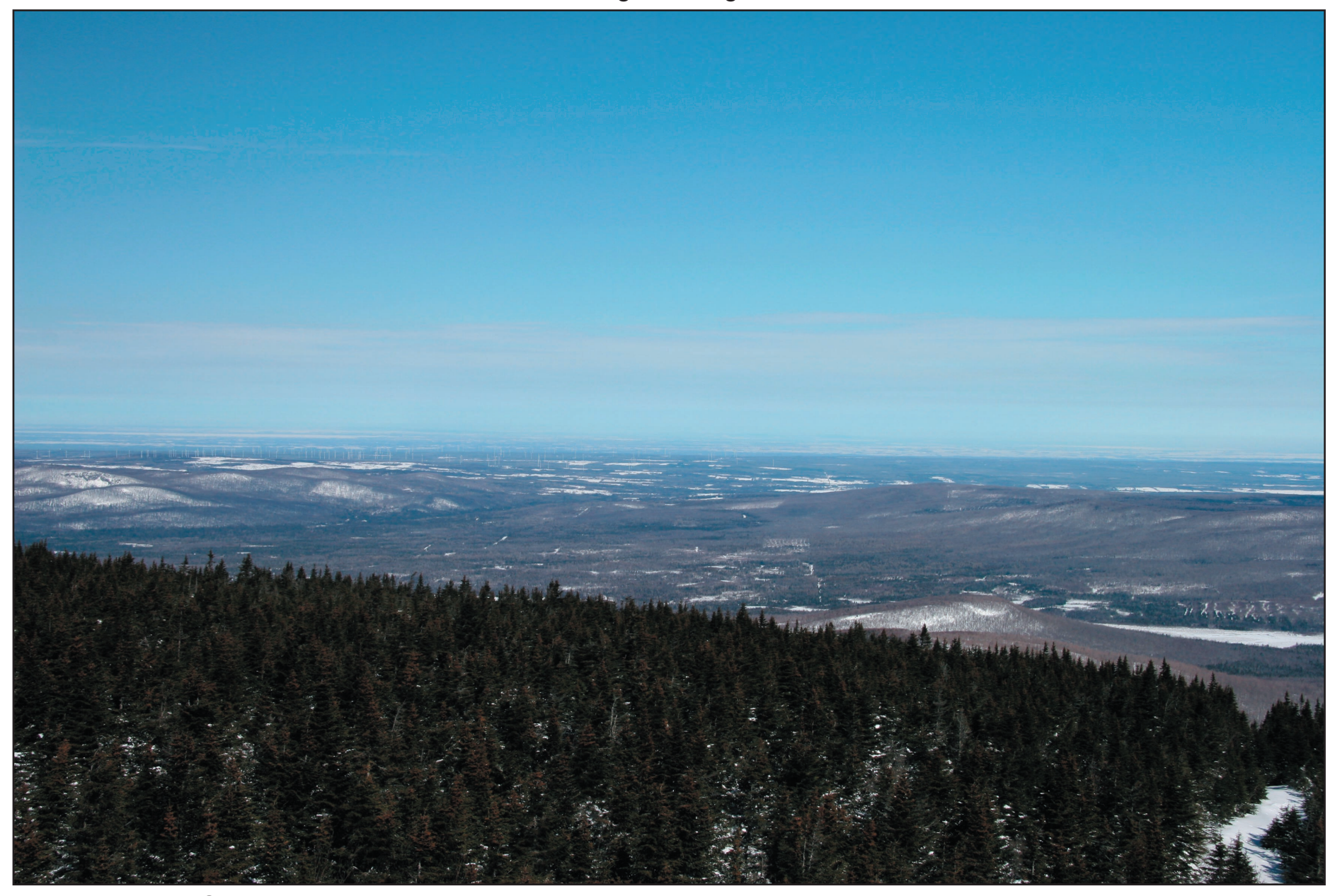
Simulation - Proposed Marble River Wind Farm and Proposed Noble Wind Farm