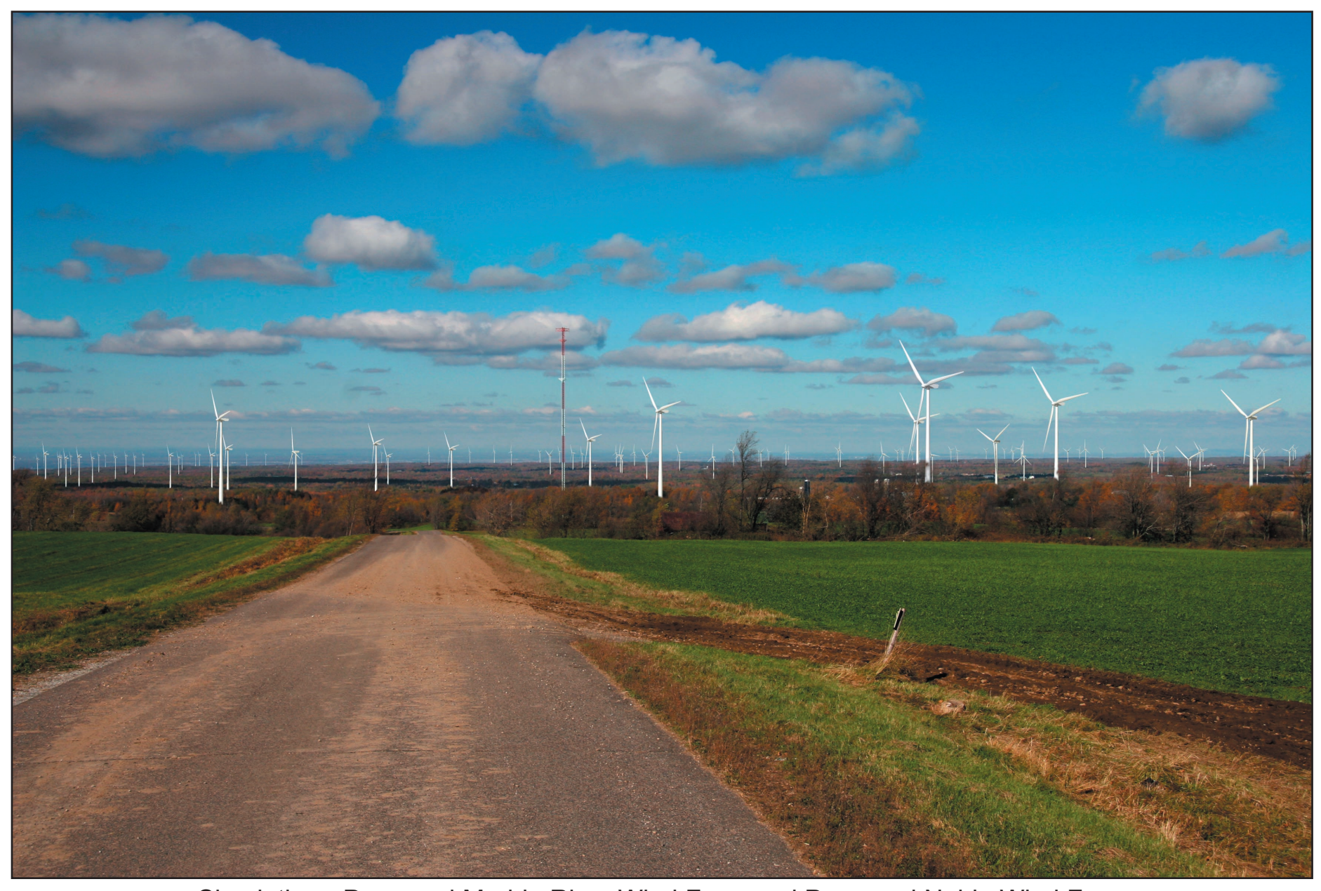
Simulation - Proposed Marble River Wind Farm and Proposed Noble Wind Farm