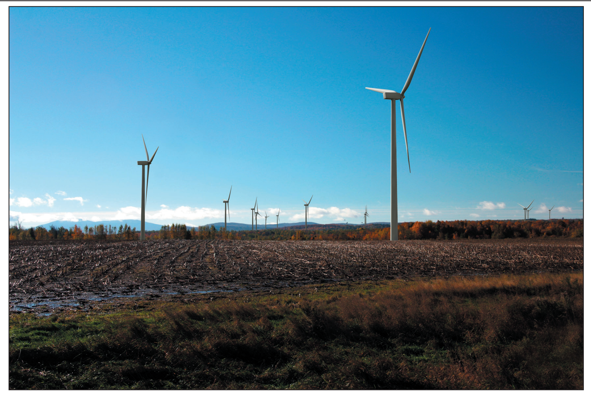
Simulation - Proposed Marble River Wind Farm