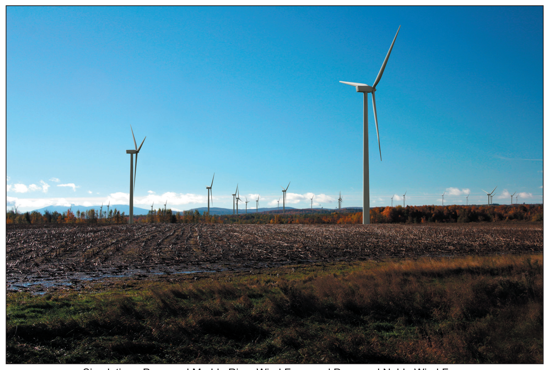
Simulation - Proposed Marble River Wind Farm and Proposed Noble Wind Farm