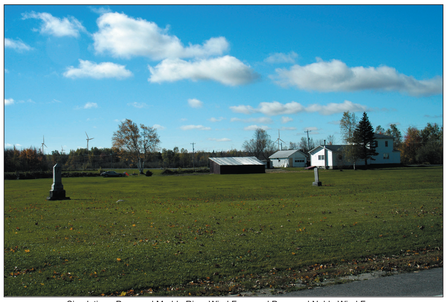
Simulation - Proposed Marble River Wind Farm and Proposed Noble Wind Farm