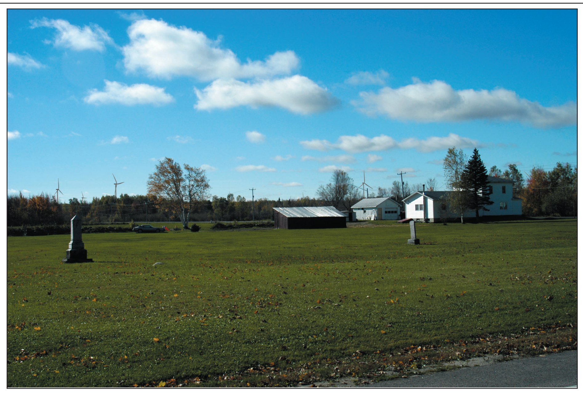
Simulation - Proposed Marble River Wind Farm