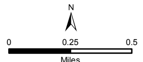
Figure 4 Marble River Wind Farm NRCS Soil Survey

P:\Marble River Wind Farm\GIS\Spatial\MXD\ Wetland_Delineation_Report_2007\Figure4_Soils.mxd June, 2007